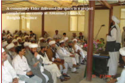
Project completion ceremony at Abkamary District in Badghis Province.