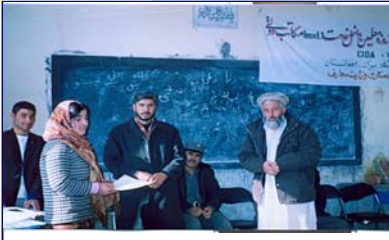
Award certification to the participants of Inset I training