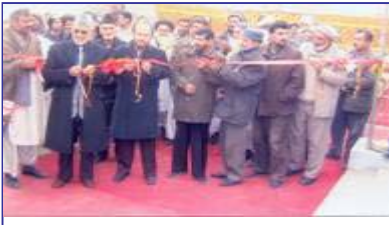
Laghmani Girls Secondary School at Charikar under EQUIP