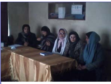
Branch Manager meeting with the Credit Officers in Polishukta Branch, Kabul

BRAC firmly believes and is actively involved in promoting human rights, dignity and gender equity through poor people's social, economic, political and human capacity building.