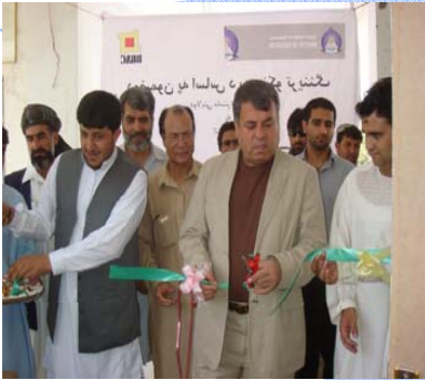
Subject Training courses inaugurated by Provincial Governor in Kandahar Province

BRAC Afghanistan firmly believes and is actively involved in promoting human rights, dignity and gender equity through poor people's social, economic, political and human capacity building.