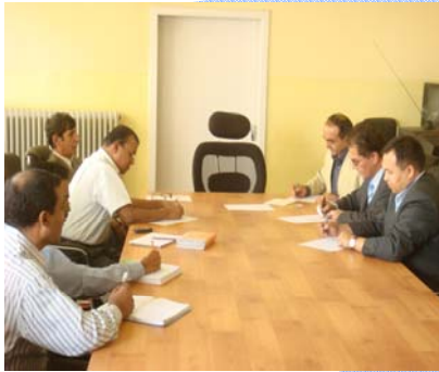
Meeting with officials of the Ministry of Education on Early Childhood Development

BRAC Afghanistan firmly believes and is actively involved in promoting human rights, dignity and gender equity through poor people's social, economic, political and human capacity building.