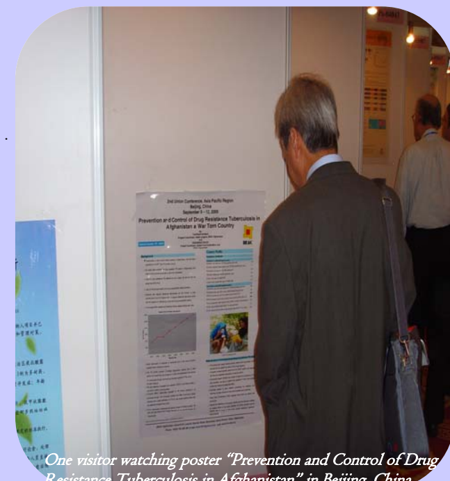
One visitor watching poster "Prevention and Control of Drug Resistance Tuberculosis in Afghanistan" in Beijing, China

BTRC submitted a Concept Note on Gender Equality to the UNIFEM. A tripartite Memorandum of Understanding (MOU) have been signed among BRAC Afghanistan, UNICEF Afghanistan, and the Ministry of Public Health (MoPH) for providing training on "Water, Sanitation and Hygiene Practices" to the Community Health Workers (CHW) of Afghanistan. BTRC furthermore signed MOUs with different INGs like Swiss Committee for Afghanistan (SCA), Norwegian Church Afghanistan (NCA), Community Centre for the Disabled (CCD), World Vision Afghanistan for providing different training courses on Marketing & Small Business Analysis, Entrepreneurship Development & Micro Finance, Modular Course, General Business and Marketing respectively.