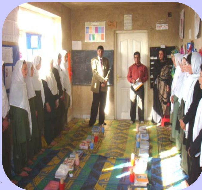
Country Program Head of BRAC Afghanistan visits BRAC Community Based Schools in Kabul

He also expressed his deep satisfaction on the performance of the BRAC CBS students along with on the contribution of concerned BRAC officials in regard of ensuring quality education for the out of school children.