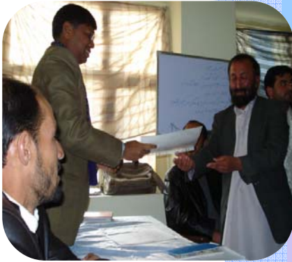
CPH awards best Lab Technician in Ghor

BRAC Afghanistan firmly believes and is actively involved in promoting human rights, dignity and gender equity through poor people's social, economic, political and human capacity building.