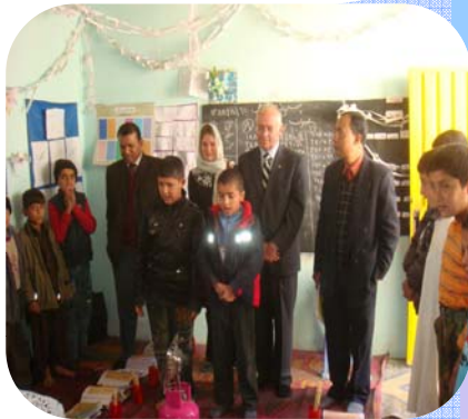
H.E Canadian Ambassador visits BRAC schools

BRAC Afghanistan firmly believes and is actively involved in promoting human rights, dignity and gender equity through poor people's social, economic, political and human capacity building.