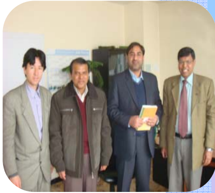
Country Program Head met with H.E. Deputy Education Minister

BRAC Afghanistan firmly believes and is actively involved in promoting human rights, dignity and gender equity through poor people's social, economic, political and human capacity building.